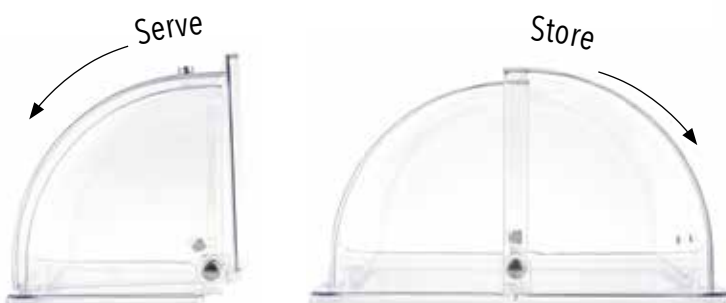
Easy rolltop cover with lip to keep it in place while serving and displaying. Fits full size wood crates listed on page 79 of our catalog.