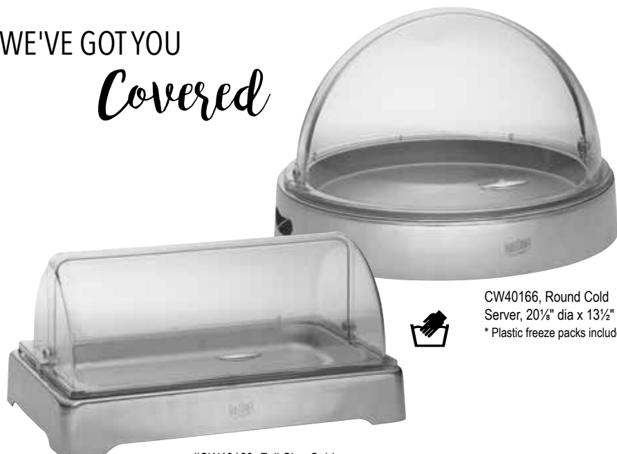
CW40166, Round Cold Server, 20 \frac{1}{8} " dia x 13 \frac{1}{2} " * Plastic freeze packs included