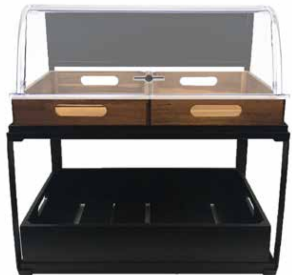
#PC1, Rectangular Cover, 21½ x 13¼ x 7½" shown with Gastronorm Display Crate #CRATE12, Half Size Crate and Two-Tiered Crate Frame Riser, #11000 – See catalog for more information