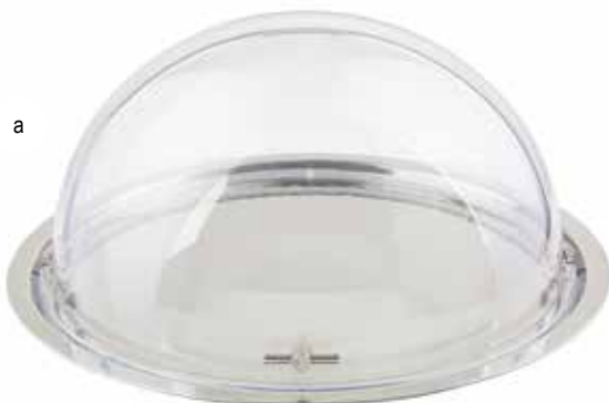
#PC2, Round Cover, 19 dia x 10" shown with #RPD21, Remington Collection™ Round Display Tray, 21"