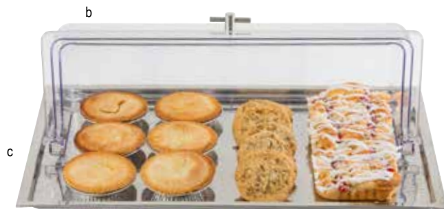
Shown with RPD2415.