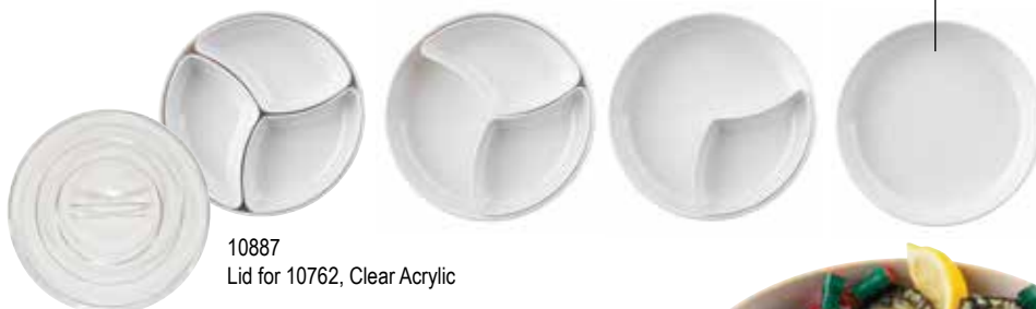
10887 Lid for 10762, Clear Acrylic