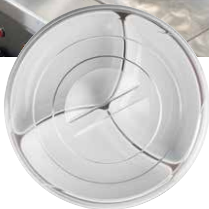
10762 Bowl with Lid, (3) 10 1/2 oz Inserts, 9 1/4" dia x 2 3/4"

9 1/4" bowl does double duty as a tray or plate