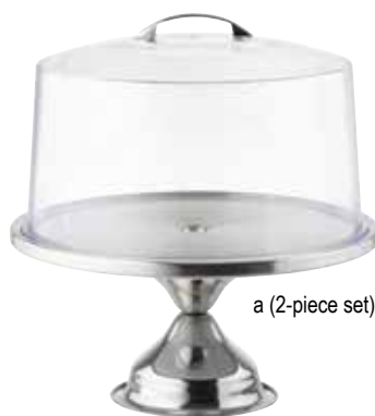
a (2-piece set)