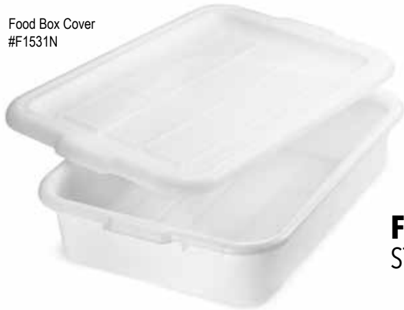
#1529N, 5" Food Storage Box, 4 gal