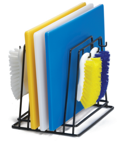
*Brushes and boards not included.