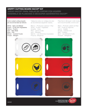
HACCP chart & stickers included in kits