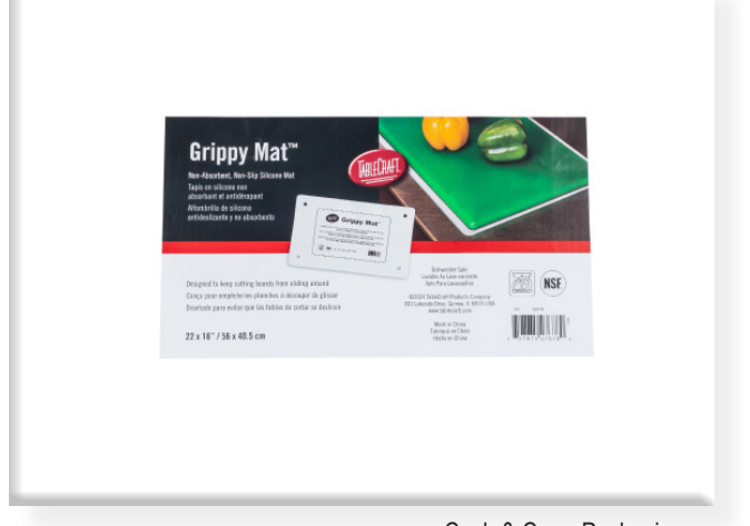
Cash & Carry Packaging