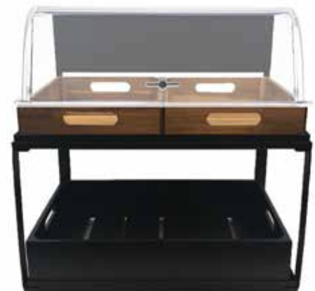
#PC1, Rectangular Cover, 21½ x 13¼ x 7½" shown with Gastronorm Display Crate #CRATE12, Half Size Crate and Two-Tiered Crate Frame Riser, #11000 – See catalog for more information

Easy rolltop cover with lip to keep it in place while serving and displaying. Fits full size wood crates listed on page 79 of our catalog.