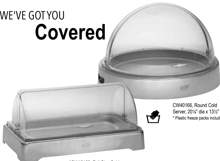
CW40166, Round Cold Server, 20 \frac{1}{8} " dia x 13 \frac{1}{2} " * Plastic freeze packs included